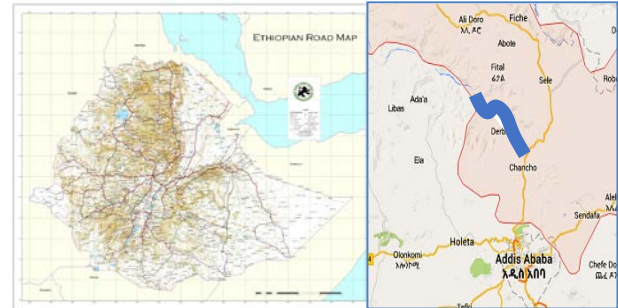
Figure 2.1: Map of the Project Area

Due to rapid economic growth of the country, there is a high demand for cement and the existing Chanco – Derba – Becho road is a potential corridor for cement production. There are existing cement factories which are under operation and also new cement factories are underway. Among the new cement factories under construction is Derba Midorc Cement Plc, the biggest cement factory in Ethiopia. This factory is expected to produce 7000 Tons of cement per day. Apart from cement factories, there are other ongoing development projects like flower farming and related development projects. From these, the socioeconomic developments in the area will generate too much traffic, in which the existing road will not be able to accommodate the current and future transport smoothly and satisfactorily. In order to satisfy the demand of the emerging economy for huge transport of cement and other productions, it is therefore required to upgrade the existing road to a higher standard.